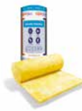
Acoustic Partition Roll (APR)