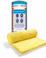
Multi Acoustic Roll