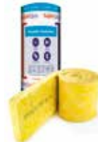
Party Wall Roll (Masonry)