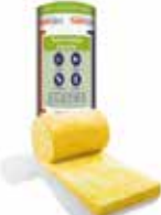
Timber & Rafter Roll 32/35/40