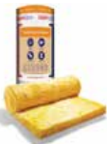
Cladding Mat 32/35/37/40