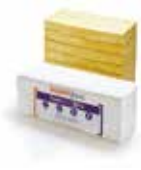
Multi Purpose Acoustic Slab