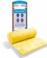
Acoustic Partition Roll (APR)