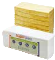
Timber & Rafter Batt 32/35/40