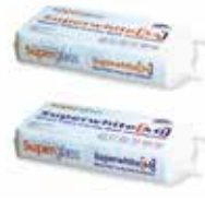
Superwhite 34/40 Blown Wool