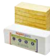
Timber & Rafter Batt 32/35/40