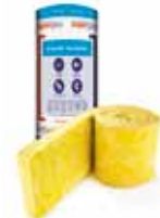
TF Party Wall Roll (Timber Frame)