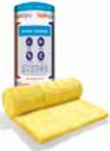
Multi Acoustic Roll