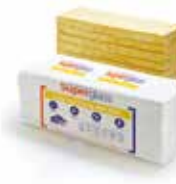
Superwall 32/34/36 Cavity Batt