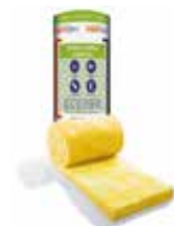
Timber & Rafter Roll 32/35/40