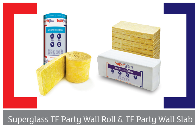
Superglass TF Party Wall Roll & TF Party Wall Slab