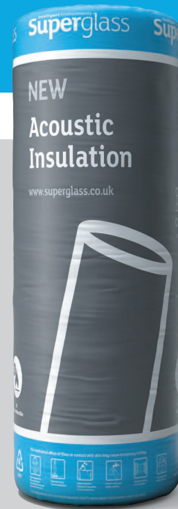
Superglass Party Wall Roll

External flanking wall: Masonry (both leaves) with 50mm (min) cavity - fully filled or partially filled with Superglass Superwall Cavity Slabs or fully filled with Superglass Superwhite 34 Blown Cavity Insulation.