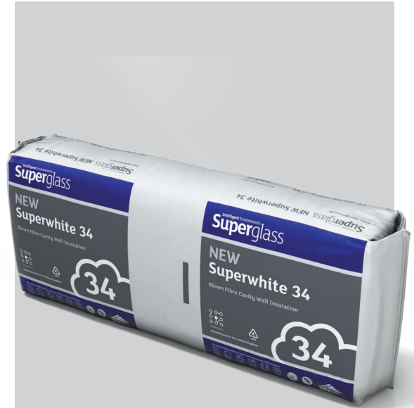
Superglass Superwhite 34 Blown Insulation