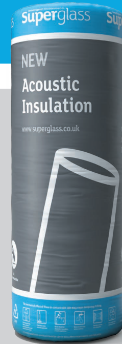
Superglass TF Party Wall Roll

Wall width: 240mm (min) between inner faces of wall linings 50mm (min) cavity (gap between wall panels) 68mm (min) between stud frames Wall lining: 2 or more layers of gypsum-based board (total nominal mass per unit area 22 kg/m 2 ), both sides - all joints staggered Insulation: SUPERGLASS TF PARTY WALL ROLL Sheathing: 9mm (min) thick board. Absorbent material: 60mm (min) mineral wool batts or quilt (density 10 - 60kg/m 3 ) both sides i.e Superglass Multi Acoustic Roll, Superglass Timber & Rafter Roll Ties: Between frames not more than 40mm x 3mm, at 1200mm (min) centres horizontally, one row of ties per storey height vertically. External (flanking) wall: Outer leaf masonry with minimum 50mm cavity.